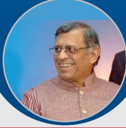
CA. S. Gurumurthy (Renowned Journalist & Board Member RBI)