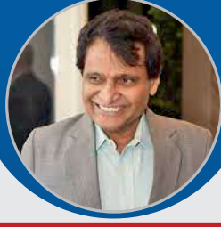
CA. Suresh Prabhu (India's Sherpa to the G7)