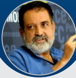
CA. T. V. Mohandas Pai (Padma Shri Awardee and Former Board Member, Infosys)