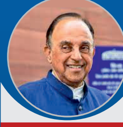
Dr. Subramanian Swamy (Former Member of Rajya Sabha)