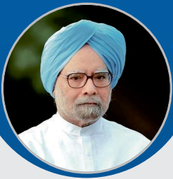
Dr. Manmohan Singh (Former Prime Minister of India)